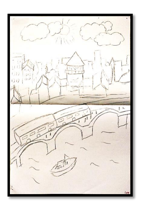
Figure 1 Panorama of Istanbul

Note: Figure 1 presents the panorama of Istanbul featuring a 23-year-old female, currently in her 4th year at Istanbul University, and having lived in Istanbul for 3 years.