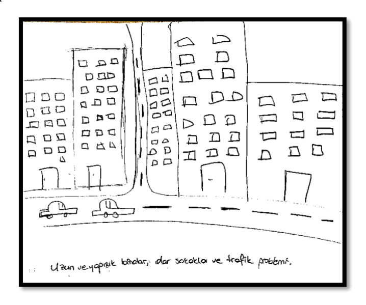
Figure 2 Problems of Istanbul

Note: Figure 2 presents the problems of Istanbul featuring a 22-year-old female, currently in her 3rd year at Altınbas University, and having lived in Istanbul for 22 years. The expression 'High rise and dense buildings, narrow streets and traffic problem' is the English translation of the Turkish phrase depicted in the figure.